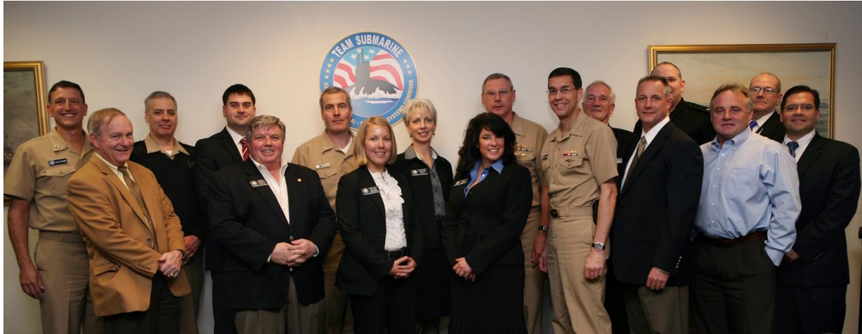
Figure 2 - PSNBA Delegation with NAVSEA Leadership