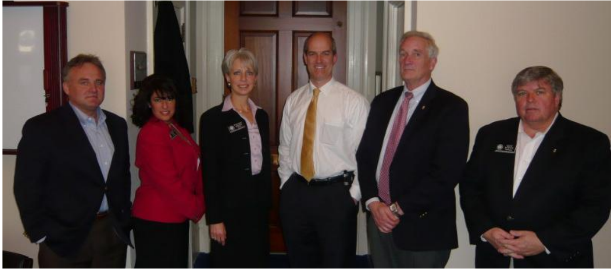
Figure 3 - PSNBA Delegation Visits with Congressman Larsen